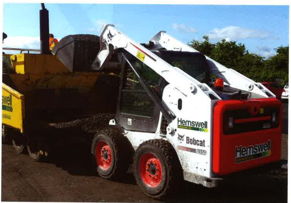
The S550H high flow skid-steer loader is one of the most popular Bobcat compact loaders for road contractors

Many road contractors are equipped to carry out all types of surfacing using asphalt and bitumen macadam. Projects covered include preparation, drainage and surfacing on roads, footpaths, repairing potholes, tennis courts and other sports surfaces, playgrounds, forecourts, driveways, car parks, caravan sites, estate roads, farm roads and silage bays, industrial/transport yards, warehousing storage facilities and ports and docksides, encompassing virtually any hard standing area that requires a durable surface.