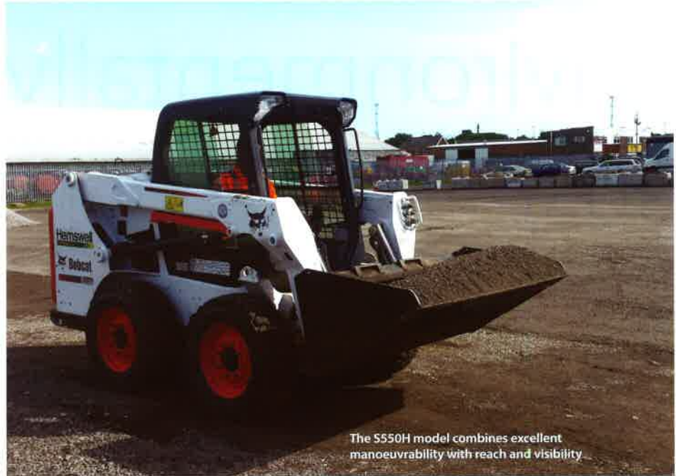
The S550H model combines excellent manoeuvrability with reach and visibility

Windows on the sides and rear of the cab have been increased in size to provide more visibility to the tyres and the back of the machine. The larger top window makes it easier and more comfortable for the operator to see an attachment with the lift arms raised,